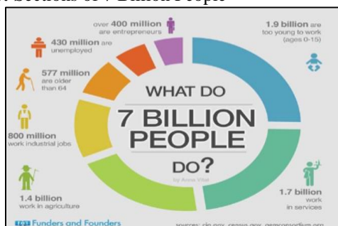
Table 8: Sections of 7 Billion People

Reference: https://www.google.co.in/url?sa=t&source=web&rct=j&url=http://businessworld.in/amp/article/Covid-19-And-Textile-Industry/09-05-2020-