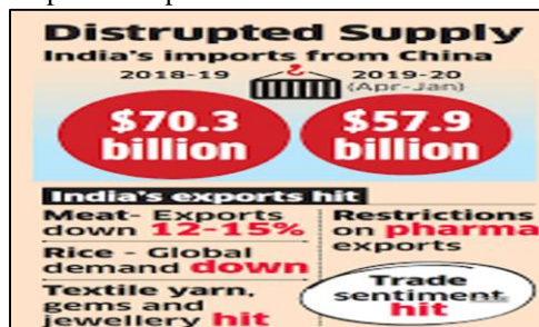
Table 5: Coronavirus pandemic hit Indian industries in terms of both Export & Import

Reference: https://textilevaluechain.in/2020/04/01/impact-of-covid-19-coronavirus-on-global-and-domestic-market-of-textile-and-fashion-industry/