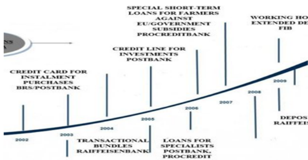
Fig. 2: Innovative bank products

traditional activities through setting up subsidiaries and joint ventures. In a recent move, the Life Insurance Corporation increased its stakes in Corporation Bank and is planning to sell insurance to the customers of the Bank. Corporation Bank itself has been planning to set up an insurance subsidiary since a long time. Even a specialized DFI, like IBI, is now talking of turning into a universal bank. All these can be seen as steps towards an ultimate culmination of financial inter mediation in India into universal banking.