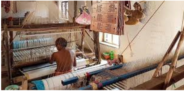
Figure 1: Traditional weaving in Kerala

attitudes, enhancing monetary benefits, and ensuring timely payments to handle unforeseen circumstances (Asha, Lekshmi, & Nayana, 2017).