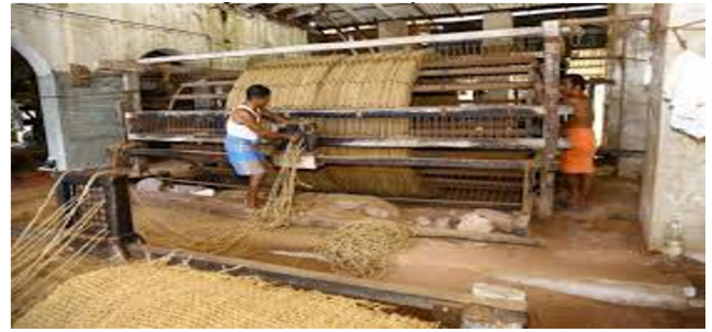
Figure 2: Coir industry in Kerala

The coir industry in Kerala, historically prevalent in coastal regions, is currently experiencing challenges such as closure or relocation to other states. The traditional coir spinning practices, predominantly found in rural areas, have hindered the adoption of modern methods, contributing to the decline of the industry. The research was conducted in the Kollam and Alappuzha districts of Kerala, primarily involving female workers who heavily rely on the coir industry for income in coastal areas. The industry faces multiple issues, including labour shortages, insufficient government support for traditional methods, and concerns