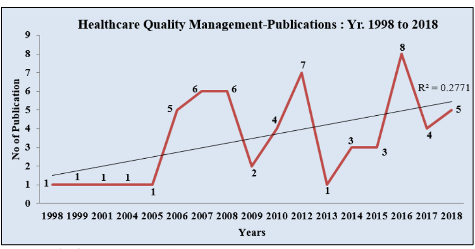
Fig. 2: Healthcare quality management publications-Year 1998 to 2018

We observed a varied number of publications (n=59) during the last 20 year period (1998-2018). Figure 2 illustrates that the quality management studies were bare minimum during the period from 1998 till 2005, which may be because the quality management culture was slowly instilling into the healthcare system during this period. However, majority of publications occurred during the period from 2006 to 2012 (n-30) and thereafter during the period 1998 to 2009 the number of studies dropped and diminished to 7 articles. Nevertheless, the number of research increased to 17 studies during 2016 to 2018, which may further increase in the coming years.