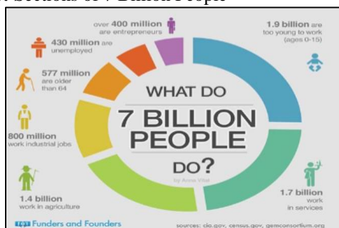
Table 8: Sections of 7 Billion People

Reference: https://www.google.co.in/url?sa=t&source=web&rct=j&url=http://businessworld.in/amp/article/Covid-19-And-Textile-Industry/09-05-2020-