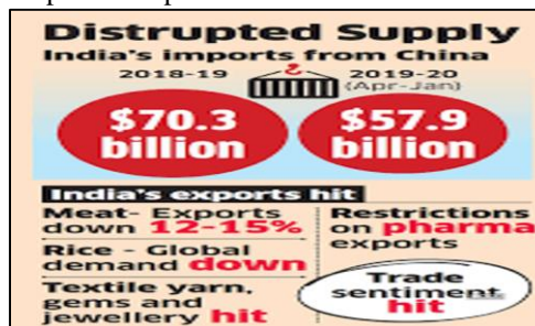
Table 5: Coronavirus pandemic hit Indian industries in terms of both Export & Import

Reference: https://textilevaluechain.in/2020/04/01/impact-of-covid-19-coronavirus-on-global-and-domestic-market-of-textile-and-fashion-industry/