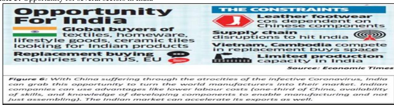
Table 3: Opportunity for several sectors in India

Additionally, domestic consumption is also getting impacted due to all India closure. New store openings have stopped in major fashion cities like Mumbai and since no new movies are produced in the recent months, the sale has further decreased. Eventually, no one likes to buy summer season collection in an autumn season due to which the sale of the product will be very difficult after the fashion of the product goes away. If some of the exporters sell their products inside India at a very low rate, the domestic local shop vendors will be in a great trouble, as people will tend to buy these products.