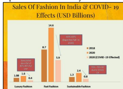
Table 6: Impact on fashion industry

Reference: https://www.iknockfashion.com/impact-on-psychology-of-fashion-after-covid-19/