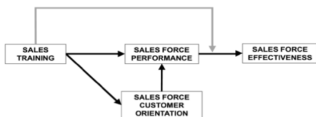
Fig. 2: Module of sales force effectiveness

Product knowledge training with relevant sales and marketing training, improves sales dynamics and thus it is conducted in quarterly cycles. Highly trained sales personnel perform better. The trained medical representative makes presentations to doctors, practice staff and nurses hospital doctors and pharmacists in the retail sector 10