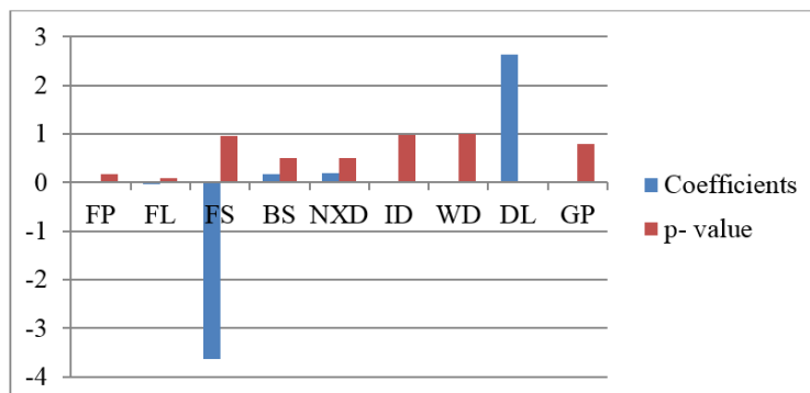
Fig. 2: Result of Panel Regression (Dependent Variables-% of shares held by Foreign Promoters)