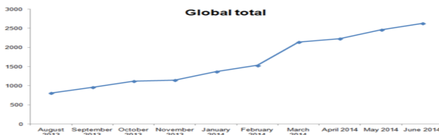
Figure 2: MOOCs Available Globally

A range of other global MOOC providers are: